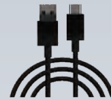
● Data Cable