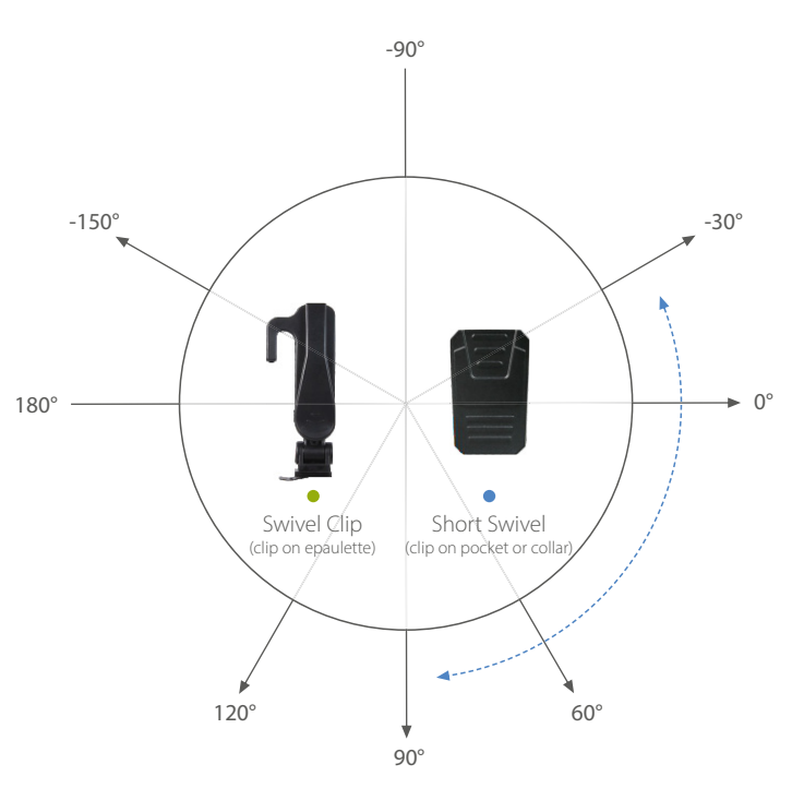
Adjust recording angle by rotating 30° every time, 360° maximum.