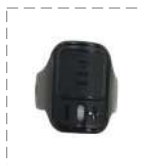
Wireless Ring PTT