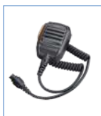
Wired Remote Speaker Microphone