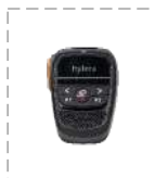
Wireless Remote Speaker Microphone